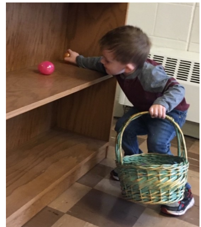
Oh! Another one!