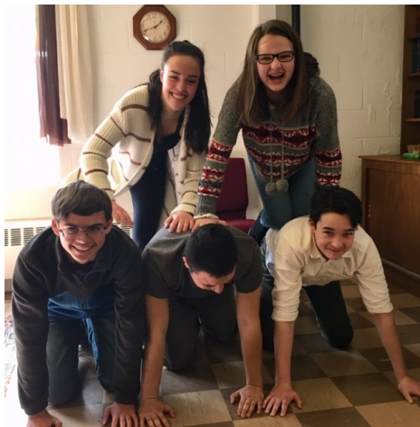
Hamming it up!