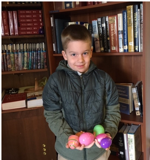
Look what Joey found!